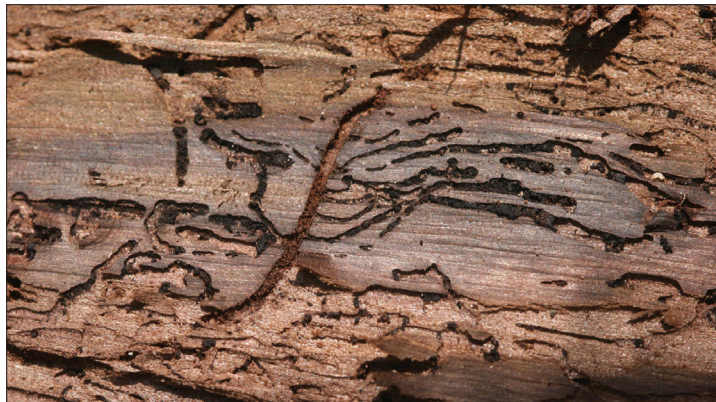
Figure 6. Walnut twig beetle galleries under the bark of a large branch.

symptoms described above. If you suspect that your walnut trees have thousand cankers disease, collect a branch 2 to 4 inches in diameter and 6 to 12 inches long that has visible symptoms. Please submit branch samples to your State's plant diagnostic clinic. Each State has a clinic that is part of the National Plant Diagnostic Network (NPDN). They can be found at the NPDN Web site ( www.npdn.org ). You may also contact your State Department of Agriculture, State Forester, or Cooperative Extension Office for assistance.