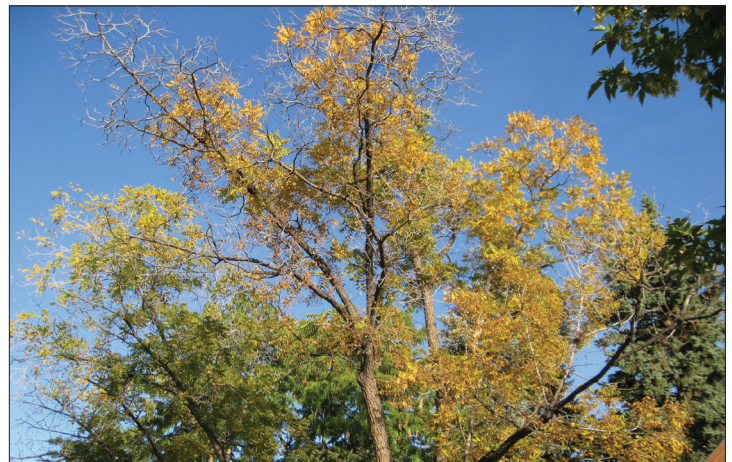
Figure 2. Wilting black walnut in the last stages of thousand cankers disease.