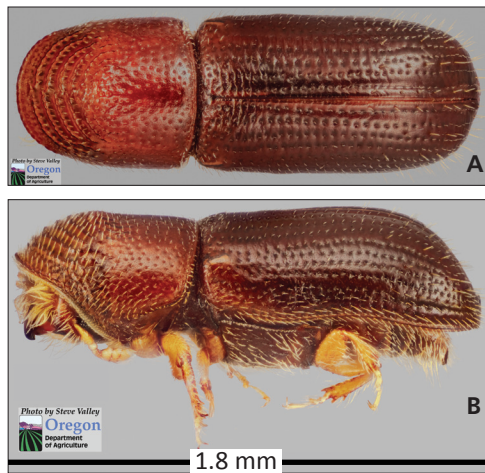
Figure 5. Walnut twig beetle: top view (A) and side view (B).

Visually inspecting walnut trees for dieback is currently the best survey tool for detecting the disease in the Eastern United States. A pheromone-baited trap placed near (but never on) walnut trees is also available for detecting the beetle ( http://www.ipm.ucdavis.edu/PMG/menu.thousandcankers.html ). Look for declining trees with the