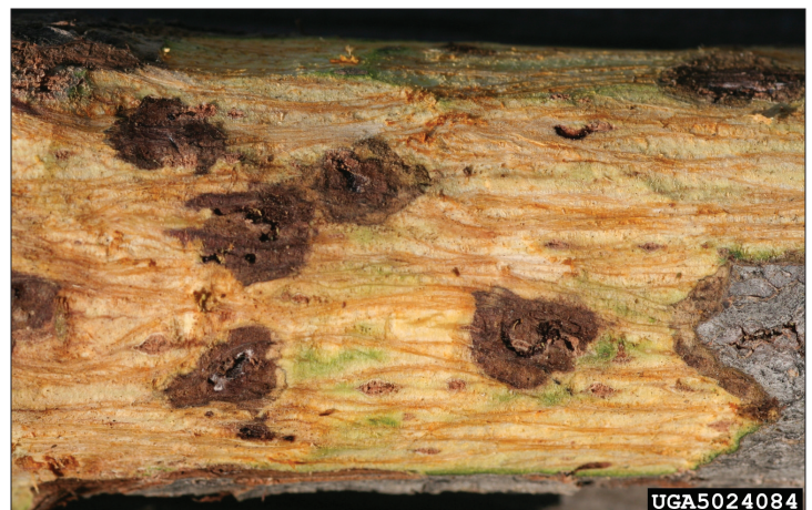
Figure 3. Small branch cankers caused by Geosmithia morbida .